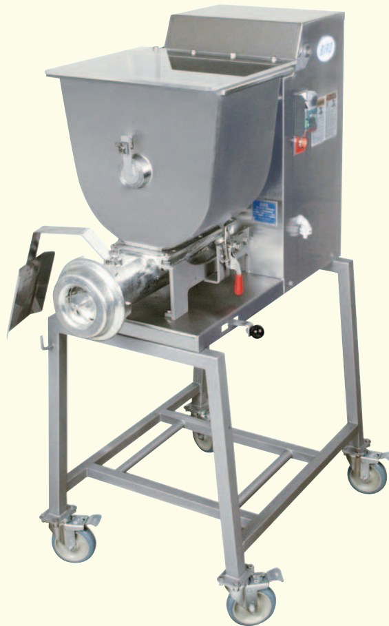
SHOWN WITH OPTIONAL EXTRA COST STAND

The Biro MINI-32 Mini Mixer Grinder makes it easier than ever to break away from the daily grind. Its 50 lb. capacity lets you grind only the amounts you need to keep the case full and still keep your grinds as fresh as possible. Now you can use the same grinder for all of your ground products without having to worry about cross contamination because the MINI-32 is so easy to clean. It's easy to disassemble, and all of the pieces are light so you can just carry all of them to the sink, wash them up, and go on to the next batch. When mounted on its specially designed cart the MINI-32 is ergonomic, so the operator doesn't have to lift a lug over their head or bend over to fill a tray. The 3 hp drive motor gives you the power you need to grind fresh ground meat, sausage, or poultry all day. So break away from the daily grind and keep your ground meat as fresh as possible with the Biro Model MINI-32.